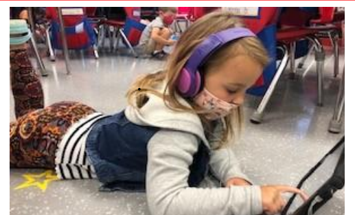
Kindergarten student using iPad purchased by Foundation