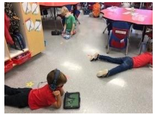
Kindergarten students using iPads purchased by Foundation

https://www.beechwood.kyschools.us/alumniNewsArticle.aspx?artID=93