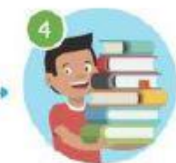
Shop the Fair