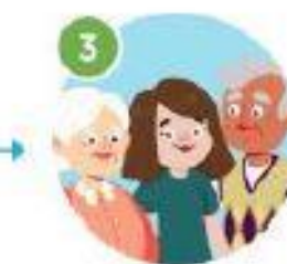
Share with Family and Friends