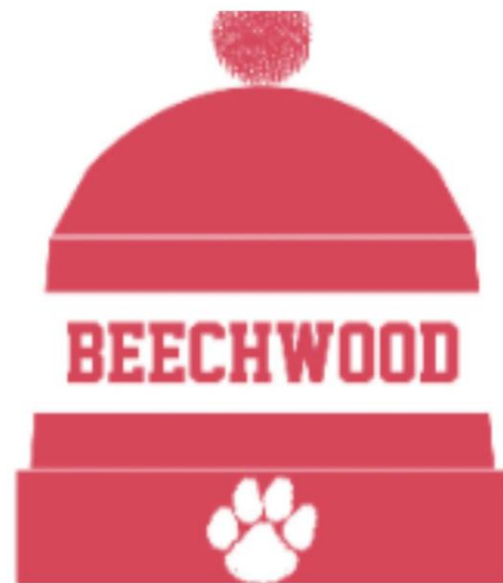
Pre-Sale Track Beanie $18.00